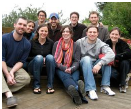
The OPF Board:

Most significantly, the Board determined that we were ready to begin scaling up the organization - and set a goal to grow from 75 Partners to 200 or 250 by the end of the year.